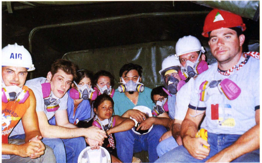
Osteopathic medical students and other volunteers travel to ground zero after terrorist attacks leveled the twin towers of the World Trade Center.

After eight hours of waiting, our hopes began to fade. Tragically, we had all of these healthcare professionals and