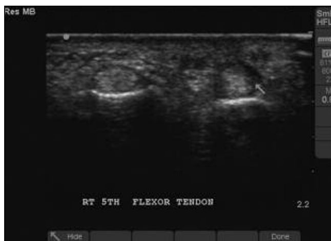
Figure 2. Ultrasound image of an affected tendon in the hand of a 64-year-old woman with Dupuytren contracture 8 weeks after completion of dry needling treatment. The image reveals a reduction in fibrous nodularity. The arrow points to a small artifact of initial nodule. Image was taken with a 13.0-MHz high-frequency linear transducer (Micromaxx; Sonosite Inc, Bothell, Washington).

the affected digits. However, with passive range of motion, she was able to achieve full extension without pain. During the fourth week of treatment, an 18-gauge needle was used for the aponeurotomy, the intention being that a larger bore needle would provide greater release of the fibrous scar tissue. At the last round of injections and manual therapy, an audible and palpable crepitus was noted during myofascial release, and the affected tendon sheaths were brought into full extension with active range of motion (Figure 1). The patient denied experiencing pain or discomfort immediately after the final treatment.